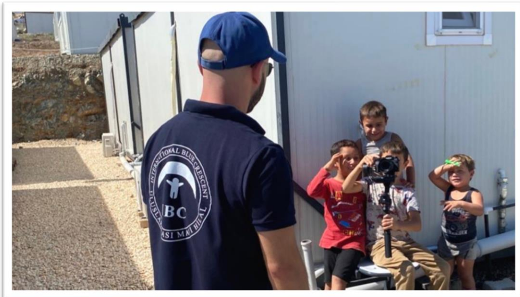
AFAD & IBC Temporary Living Area (Kirikhan, HATAY)

International Blue Crescent Relief and Development Foundation (IBC) continues its emergency response efforts and long-term support projects in the earthquake zone by signing the necessary protocols in cooperation with AFAD, Red Crescent, Municipalities, Governorships, Directorate of Migration Management and all relevant stakeholders with the priority of efficient use of resources.