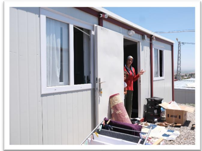
AFAD & IBC Temporary Living Area Beneficiaries (Kirikhan, HATAY)