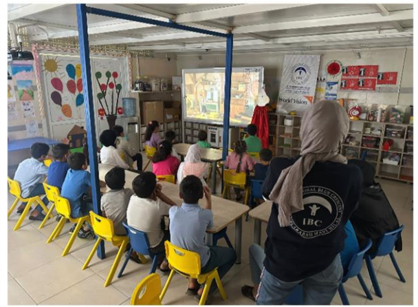
Activities for children at IBC Community Center (KILIS)