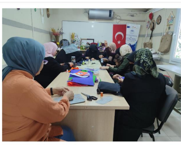
Maharetli Eller Workshop (KILIS)