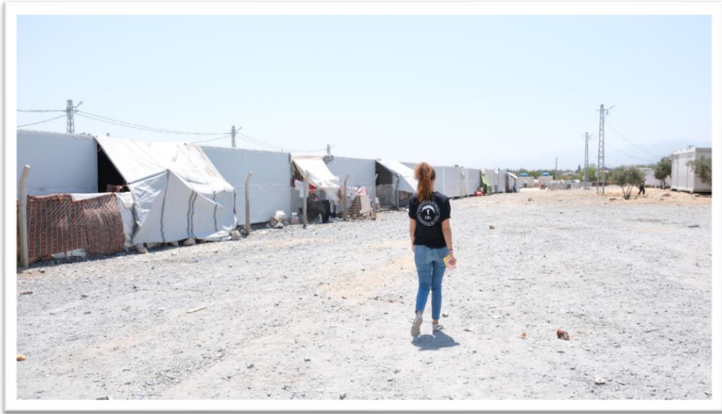
Nurdagi / GAZIANTEP