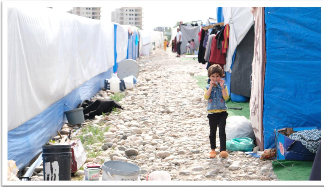
Tent City (ADIYAMAN)

According to official data, 8300 people died in Adiyaman, one of the cities with the most damaged infrastructure in the earthquake with Hatay. The demolition and debris removal of collapsed and emergency buildings have been completed in the city. Also, water cuts in the region make life difficult.