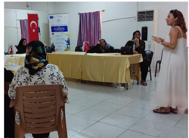
Activities for women at IBC Community Center (KILIS)