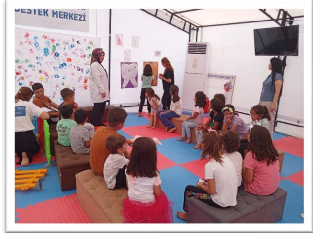
Activities for children in a Baby Friendly Space support with JISP (Elbistan, KAHRAMANMARAS)

Our tent in the Müsiad Container Camp is also specially designed for babies to develop fine motor skills. The Baby Friendly Space is open for mother and baby beneficiaries every day of the week from 9-6 and continues to create new activities.