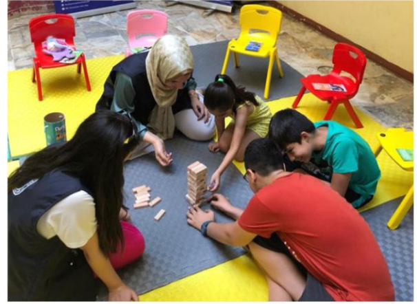
Activities for children at IBC Community Center (SANLIURFA)

In Sanliurfa, over 10,000 thousand beneficiaries have been reached through in-kind aid, psychosocial support, mental health support, social cohesion activities and individual interviews.