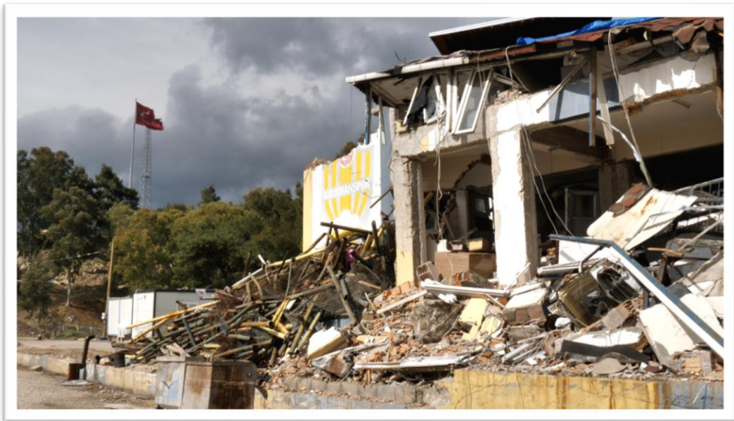
Kirikhan / HATAY

Currently, 47 thousand 772 families are hosted in 158 container cities in Hatay. Together with the ongoing projects, it is stated that the final number of containers to be reached in 221 container cities will be 77 thousand when all works are completed. Also, the first permanent houses will be delivered in November/December.