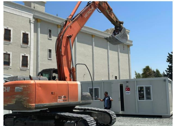
Türkiye- Korea Friendship City (Serinyol, HATAY)