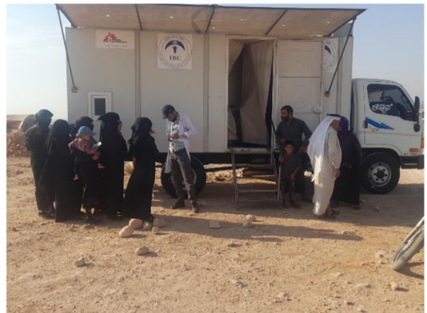
Health services support with MSF (AlBab / NORTH SYRIA)