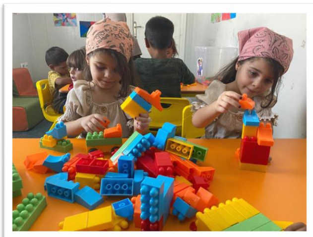
Workshops for children at Child Caravan (Nurdagi, GAZIANTEP)