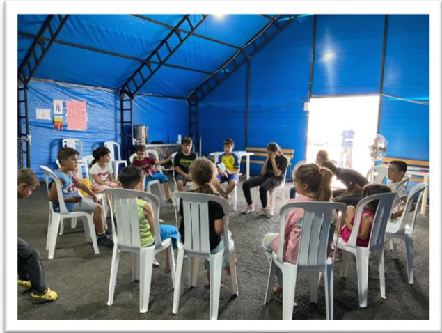
Activities for children at IBC Community Center Tent support with JISP (Elbistan, KAHRAMANMARAS)