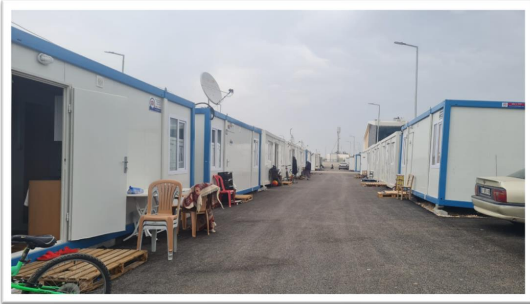
Container City (Elbistan, KAHRAMANMARAS)

In Kahramanmaras, the epicenter of two significant earthquakes, 12,659 people died. In the region where 47 buildings collapsed, tents and container cities were first set up to shelter earthquake victims. 19,404 containers were prepared in the city center and 13,983 in rural areas.