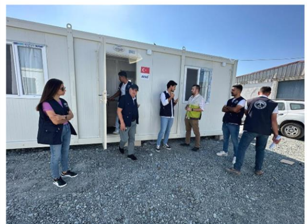
Türkiye- Korea Friendship City (Serinyol, HATAY)