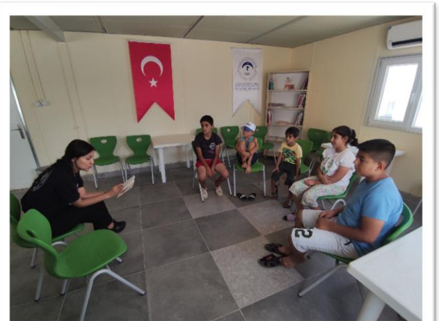
Study Center in cooperation with NEAR (İslahiye, GAZIANTEP)