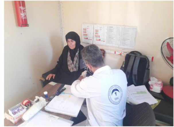
Health services support with Action Medeor (NORTH SYRIA)

IBC is the first and only Turkish NGO to support certain branches of inpatient hospitals in the region, especially in the health field, in addition to emergency humanitarian aid efforts in cooperation with Action Medeor.