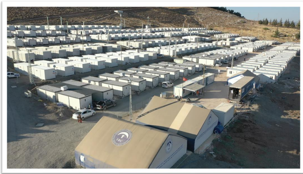
AFAD & IBC Temporary Living Area (Kirikhan, HATAY)

Undoubtedly, children are among the most vulnerable groups affected by the earthquake. IBC provides clothing, health aids (including medicines and mobile services), hygiene materials, diapers and formula for newborns, children under three, and school-age children, prioritised in its humanitarian aid. The aim is to reach children of all ages and meet their needs while preventing possible secondary and tertiary health, hygiene and growth retardation risks. At the same time, the Baby Friendly Area established in Elbistan Müsiad Container City provides breastfeeding counselling and psychosocial support to mothers who have just given birth and organises activities that contribute to children's fine motor development.