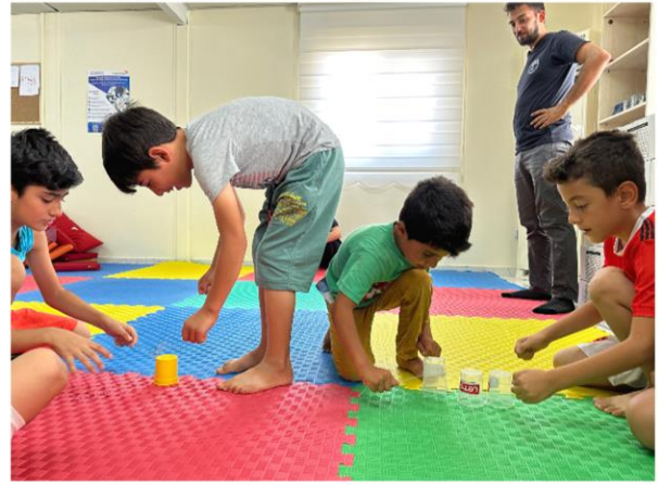
Child-Friendly Space opening ceremony and workshops with children support with World Vision (ADIYAMAN)