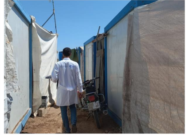
Health services support with Action Medeor (NORTH SYRIA)

The IBC Syria team continues to visit tent camps in the region within the scope of the mobile clinic project (Qatar Village, Al Hadath Camp, Sosnbat Camp, Tadif Village and Tadif Camp). As of this week, 1835 patients have been supported in the camps visited by community health teams as part of the Mobile Clinic Project. In this context, 1181 patients received outpatient treatment, 359 at the Non-Communicable Diseases Clinic, and 285 at the Sexual and Reproductive Health Clinics.