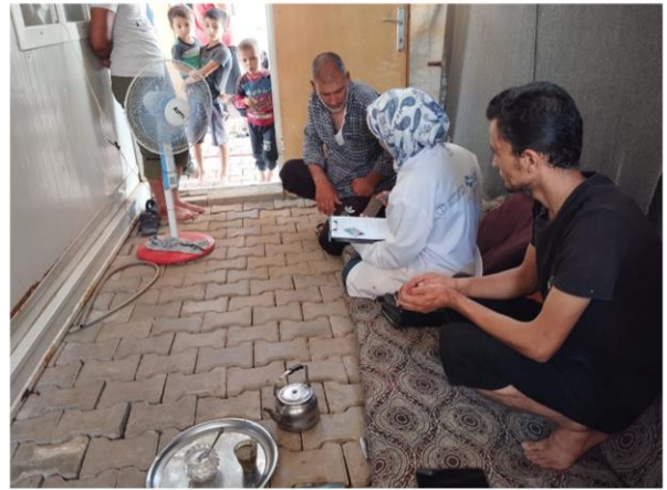
Health services support with Action Medeor (NORTH SYRIA)