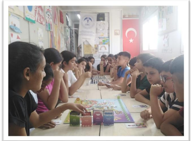
Workshops for Children at Child Caravan (Kirikhan, HATAY)