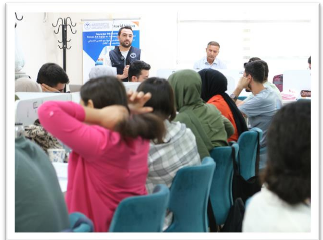
Workshops for youth (Suruc / SANLIURFA)