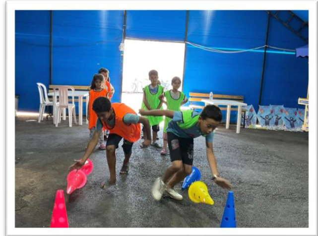
Activities for children at IBC Community Center Tent support with JISP (Elbistan, KAHRAMANMARAS)