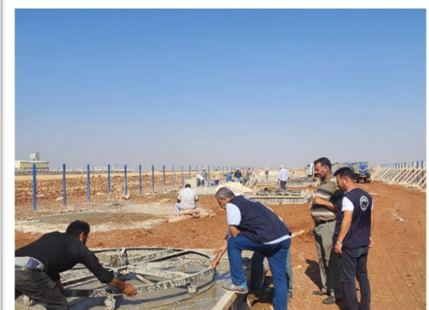
IBC Water Tank Project (Soran, NORTH SYRIA)

Our project is one of the crucial steps towards a sustainable future; we aim to raise environmental awareness in an environmentally friendly manner with a solar-powered water pumping system.