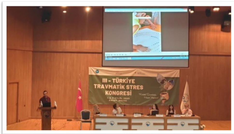
"Hayatı Yeşertmek" Congress (HATAY)

Last week, in addition to all these meetings, IBC participated in the congress titled "Hayatı Yeşertmek" and made a presentation on psychosocial support activities in the disaster area and projects implemented in the field of mental health in Hatay, one of the provinces where the devastating effects of the earthquake were felt the most.