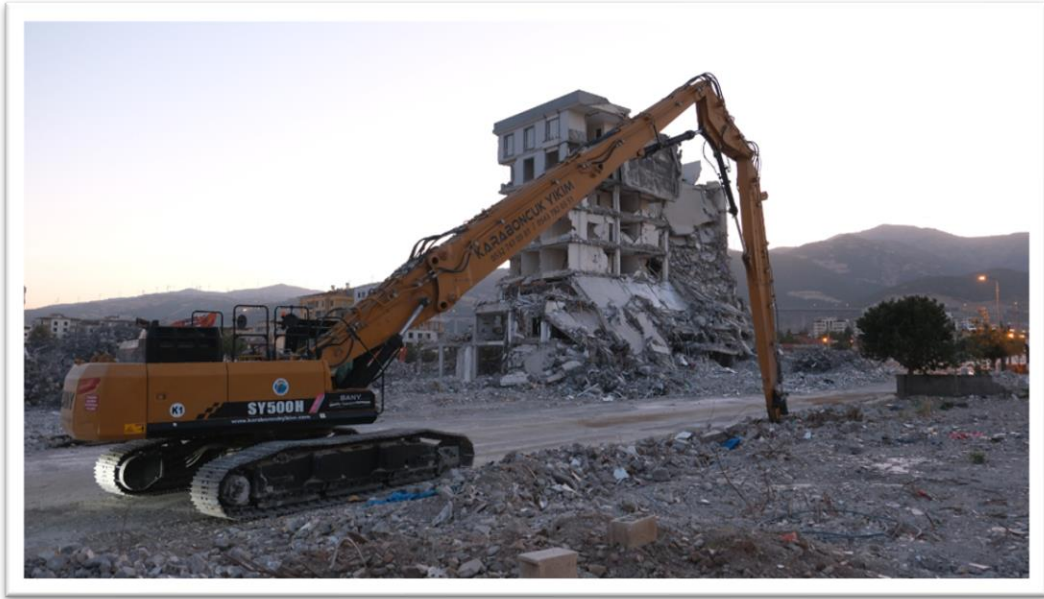
Nurdagi / GAZIANTEP

Against this backdrop, the Defne State Hospital in Hatay, built on an area of 25 thousand square meters, was completed and put into service in two months, while work on the 200-bed Iskenderun Emergency Hospital in Iskenderun district is nearing completion.