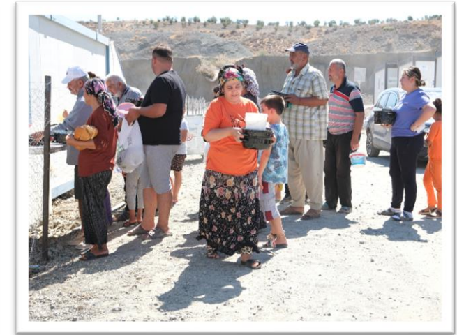
Food Distribution support with Corus International (Kirikhan, HATAY)

The area has access to electricity, water and sanitation to accommodate an estimated 3,000 people. As of September, in AFAD & IBC Temporary Living Area, earthquake survivor families have been placed in 400 containers by AFAD, and 1347 people have been registered there. Also, the Health Center containers were installed and opened for use in August.