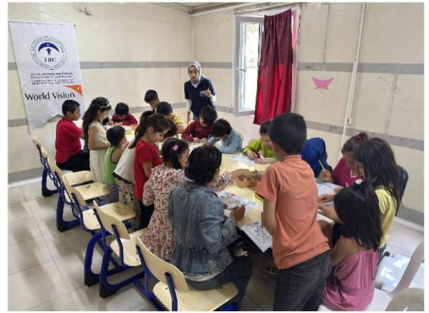
Activities for children at IBC Community Center (KILIS)

In this context, as IBC, emergency support, protection services, psychosocial support services, course services, social cohesion services and information services have been made more comprehensive in the ongoing projects.