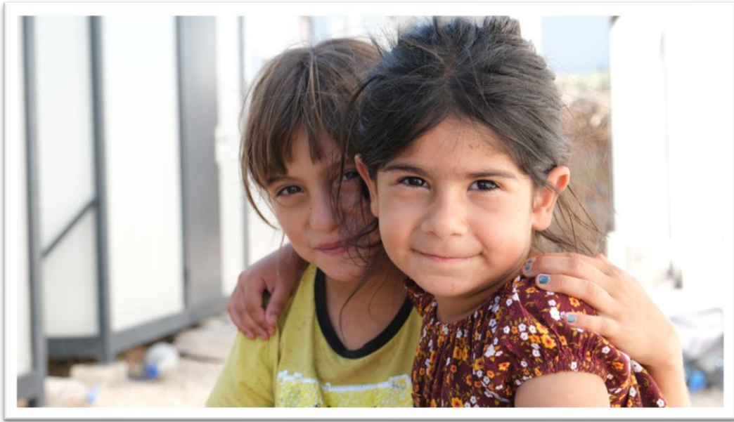
Kirikhan / HATAY

Thank you to all who continue to mobilise the heroic efforts of the many search and rescue teams. Immense and continued cooperation is needed to prevent further loss of life and suffering.