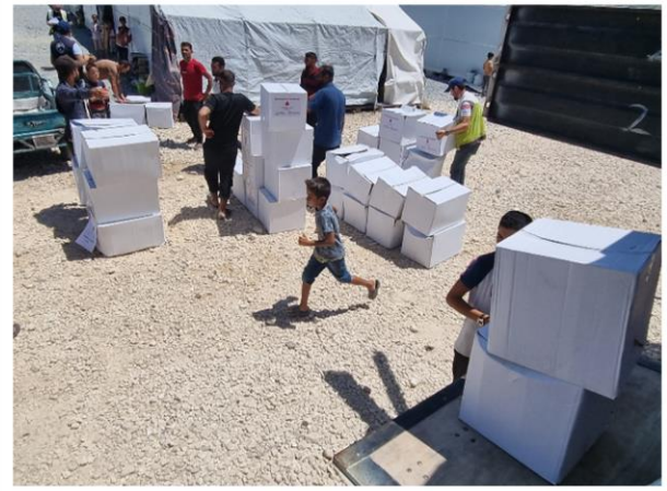
Distributions with Good Neighbors support (Nurdagi, GAZIANTEP)