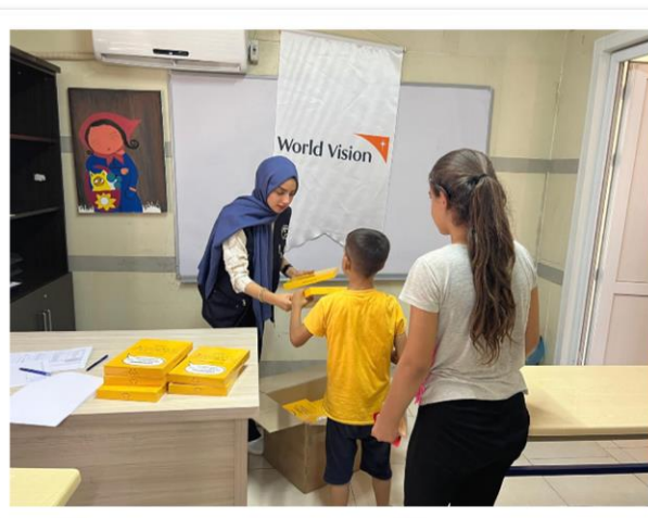
Distribution of stationery and nutrition kits for children with Word Vision support (KILIS)

In this context, stationery kits were distributed to children with World Vision's support last week. We have also started a series of awareness-raising sessions to empower women. In the past few days, the Center also organised Introduction to Photography, International Children's Day with IOM, Technology Literacy, Cats Day, Skilful Hands Handicraft Workshop, and Science and Chess Workshop with a large group of participants.