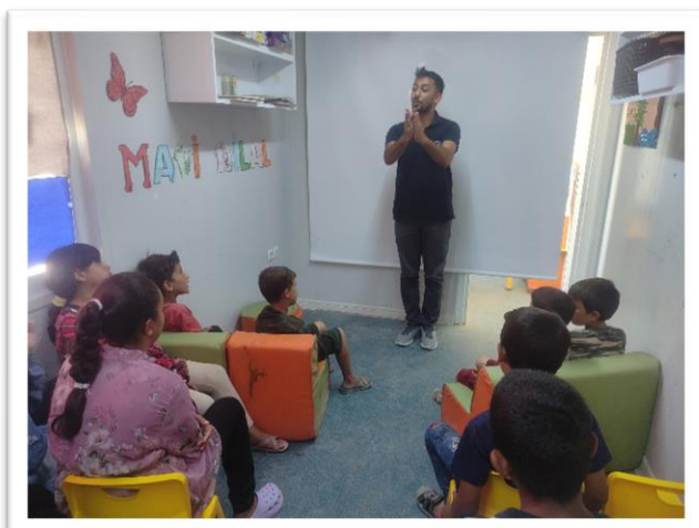
Workshops for children at Child Caravan (Nurdagi, GAZIANTEP)