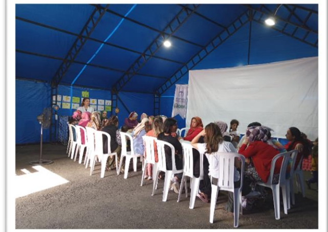
Activities for women at IBC Community Center Tent support with JISP (Elbistan, KAHRAMANMARAS)