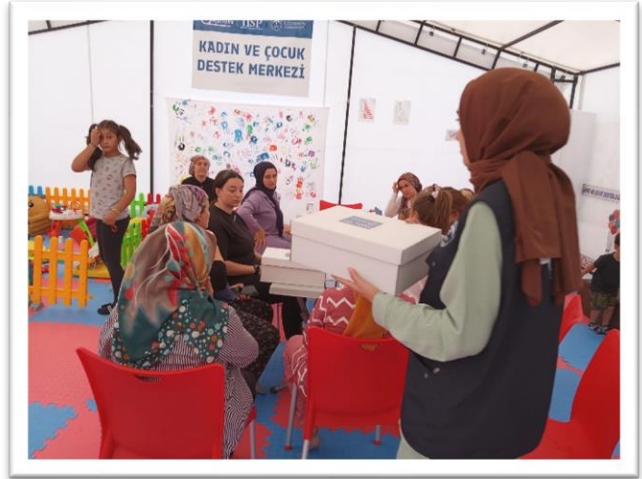
Activities for Women in a Baby-Friendly Space support with JISP (Elbistan, KAHRAMANMARAS)