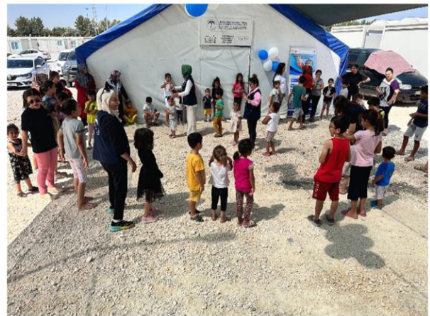
IBC Community Center Tent opening ceremony support with GIZ (ADIYAMAN)