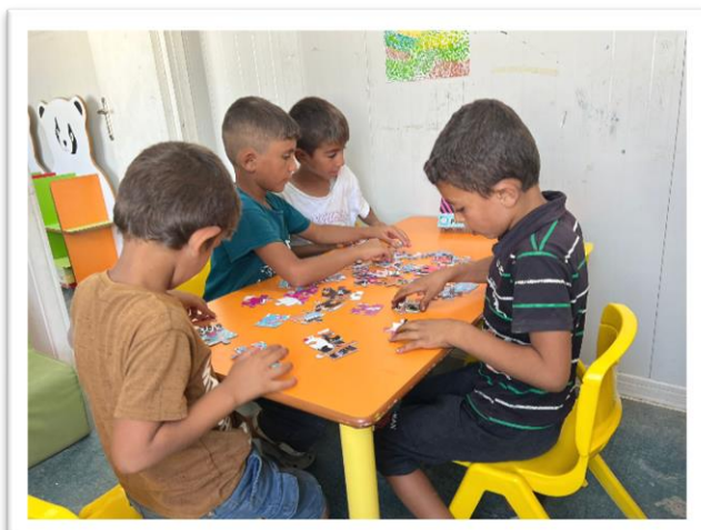
Workshops for children at Child Caravan (Nurdagi, GAZIANTEP)