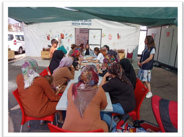
Activities for Women in a Baby-Friendly Space support with JISP (Elbistan, KAHRAMANMARAS)

In this context, with the breastfeeding counselling workshop, our nurses explain the importance of breast milk. These factors increase and decrease breast milk, expressing breast milk, breastfeeding techniques, problems experienced during breastfeeding, nutritional considerations during breastfeeding, and problems and solutions arising from improper breastfeeding. In addition to breastfeeding counselling, sensitivities such as newborn baby care, bathing, use of cotton clothes, room temperature and thrush formation are also shared by our expert nurses.