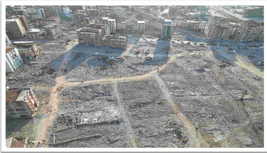
After the Debris Removed – Malatya Center (MALATYA)