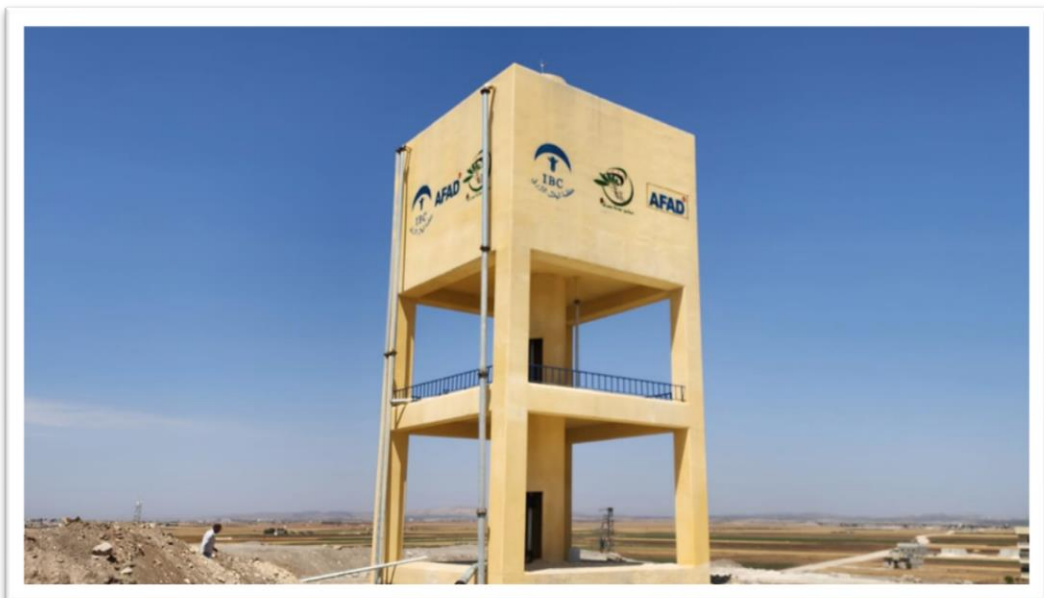
Water Tank Project (Soran, KUZZEY SURİYE)

The earthquake reportedly caused 5.85 million dollars worth of damage to the Syrian economy. While the disaster was mainly effective in the northwestern regions of Syria, more than 170,000 people fled the area until the first week of March due to the earthquake.