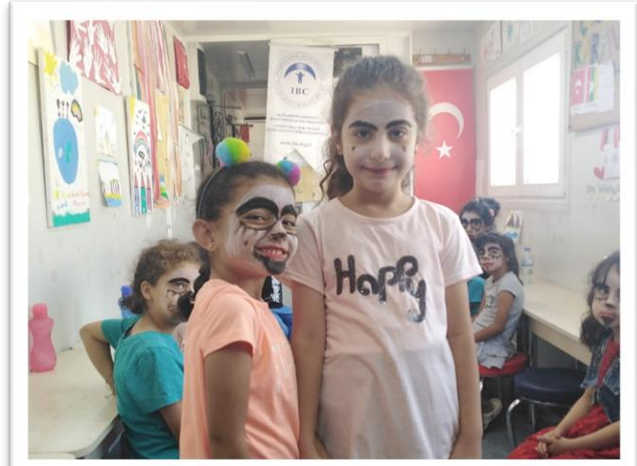
Workshops for Children at Child Caravan (Kirikhan, HATAY)