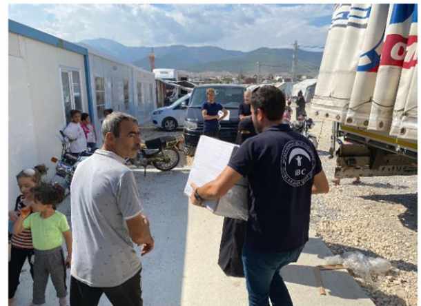
Distributions with Good Neighbors support (Nurdagi, GAZIANTEP)