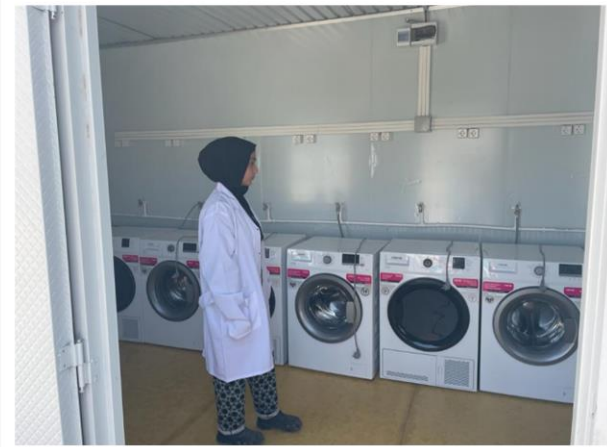
IBC Laundry (Nurdagi, GAZIANTEP)

In İslahiye, our psychosocial support activities, child-friendly area activities, essential health-physical therapy services and hot meal distribution services continue fully. We have offices in Living Space-1 Container City, Syrian Container City and AHBAP Container City.