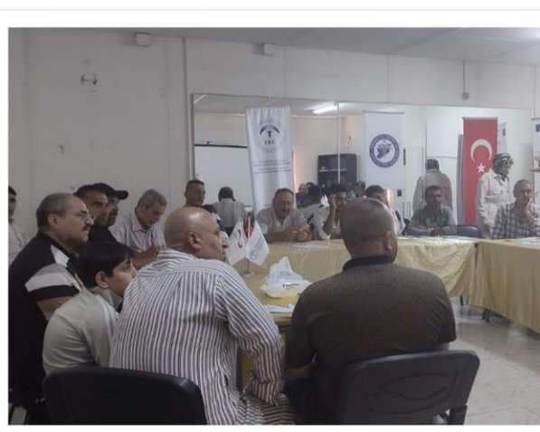
Activities for men at IBC Community Center (KILIS)