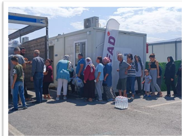
Drinking water is distributed with the support of donors (Kirikhan, HATAY)