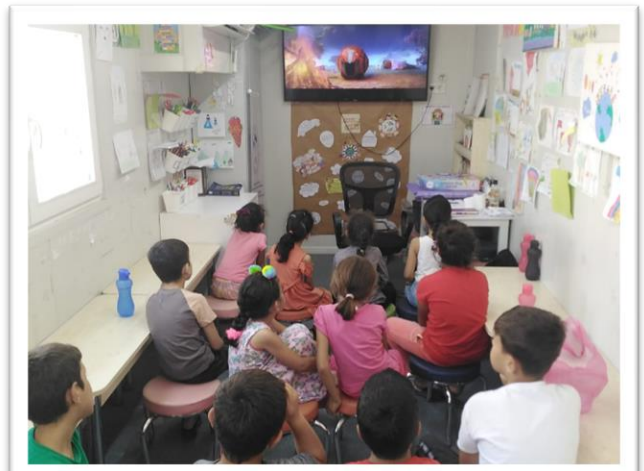
Workshops for Children at Child Caravan (Kirikhan, HATAY)