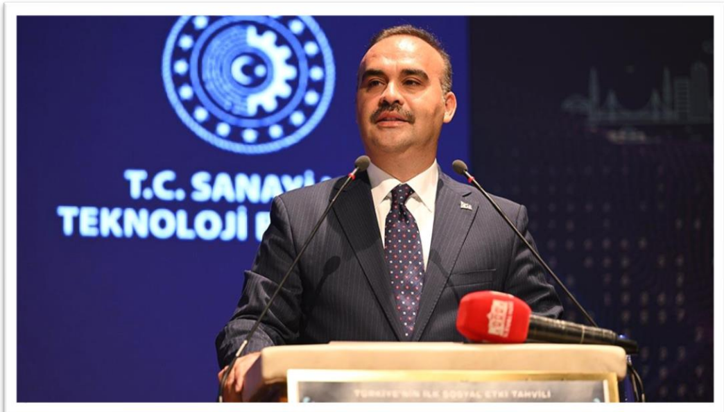
The Ministry of Industry and Technology Mehmet Fatih Kacir

The Ministry of Industry and Technology stated that they issued 479 incentive certificates for investments for sustainable development in the earthquake zone. It announced that the total investment amount for the earthquake-affected provinces is 61 billion Turkish liras.