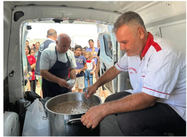
IBC Community Center Tent opening ceremony support with GIZ (ADIYAMAN)