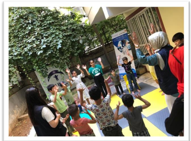
Activities for children at IBC Community Center (SANLIURFA)