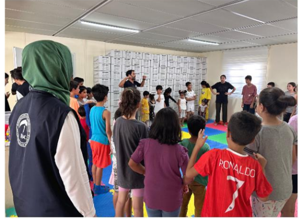
Workshops with children support with World Vision (ADIYAMAN)

Protection services for people affected by the earthquake, psychosocial support for children and adults, and grocery voucher distributions continue regularly in the region. We also conduct individual interviews with earthquake victims as part of protection and psychosocial support activities. In the past weeks, kitchen kits, baby care kits and diapers have also been distributed in the region.