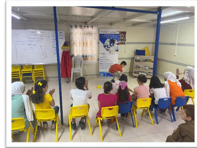
Activities for children at IBC Community Center (KILIS)

Kilis Community Center collaborates with local governments, public institutions and other NGOs to provide effective and lasting solutions to the problems faced by earthquake victims.