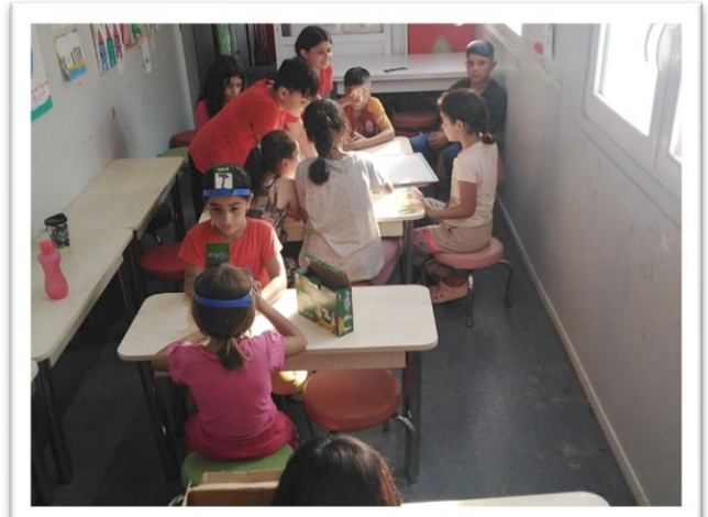
Workshops for Children at Child Caravan (Kirikhan, HATAY)