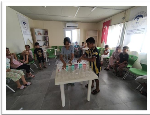
Study Center in cooperation with NEAR (İslahiye, GAZIANTEP)