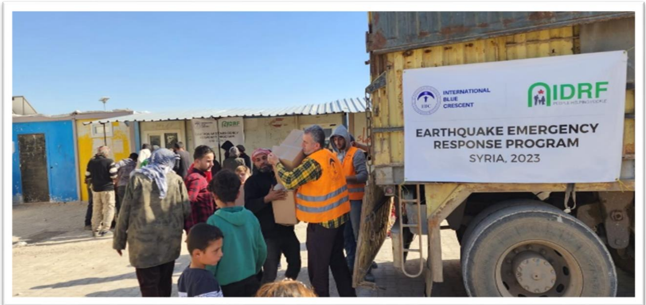
Food package distribution in Azez region with the support of IDRF

In addition, IBC's work continues at the Dabiq Health Center where services were provided for 833 patients this week. 15 patients were transferred to hospitals by IBC ambulances.