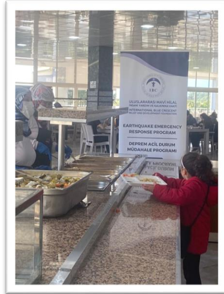
Hot meal support for people affected by the earthquake at Izmir Ozdere Air Force Special Education Center

Within the scope of the first agreement of the project, three hot meals a day are served, with a total of 35,000 meals. This week, with the support of GlobalGiving and Episcopal Relief, the centers distributed hot meals to approximately 900 people. Along with three meals for earthquake victims in the region, iftar and sahur support will continue to be provided throughout the month of Ramadan.