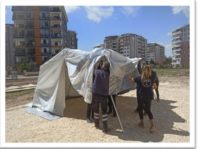
Tents set up in Adiyaman with the support of WHH