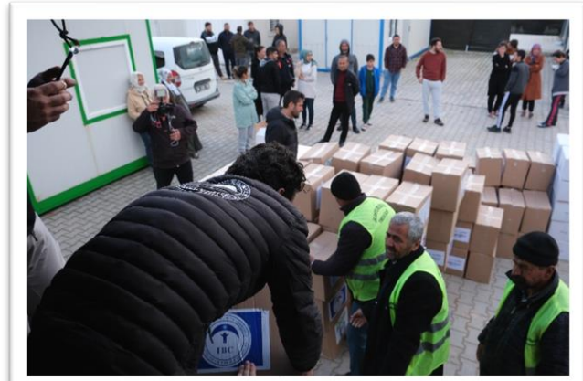
Food parcel distribution in Islahiye

Other deployments completed this week in the region: