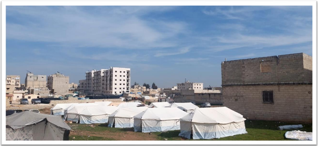
Tent camp in A'zaz, N. Syria

In the economy and labor market conditions, which have already suffered great damage in the last 12 years in Syria, approximately 170,000 employees lost their jobs due to the earthquake. While this loss directly affected 154 thousand households and more than 725 thousand people, around 35 thousand micro, small and medium-sized enterprises were also damaged. This temporary loss of employment in Syria results in a loss of labor income equivalent to at least $5.7 million per month. 3