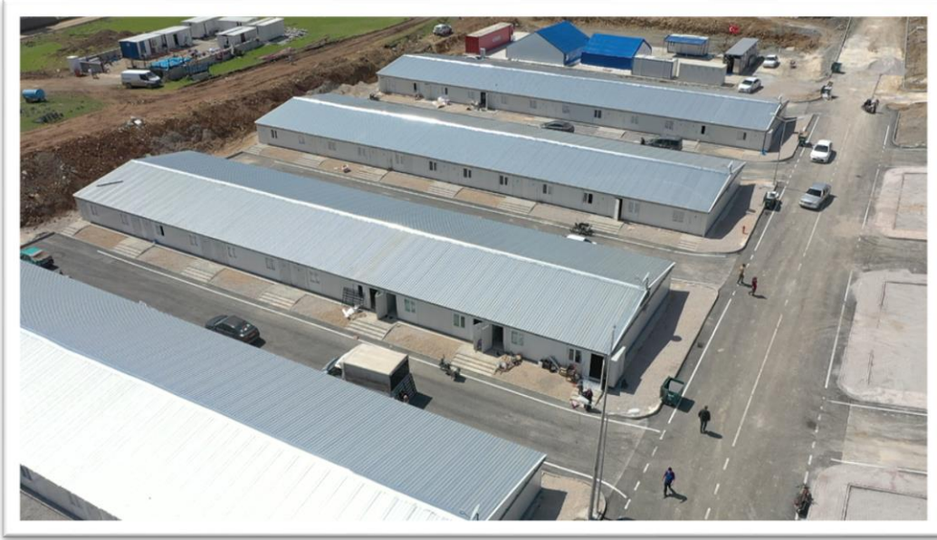
Container city located in Islahiye, Gaziantep