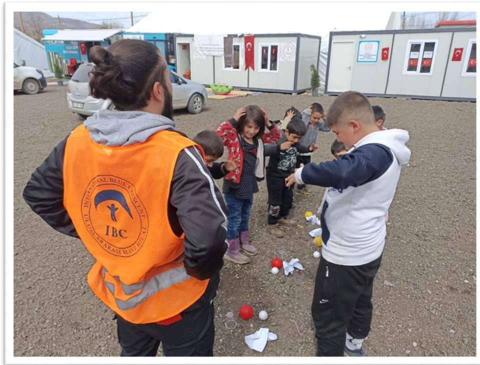
Workshops for children in Dogansehir

An IBC child-friendly area and PSS services have begun in Malatya Dogansehir with the support of GIZ. In addition, our child-wellness teams continue their activities in the region for children affected by the earthquake. This week, the distribution of mother-child hygiene kits and food kits in the Dogansehir region was completed.