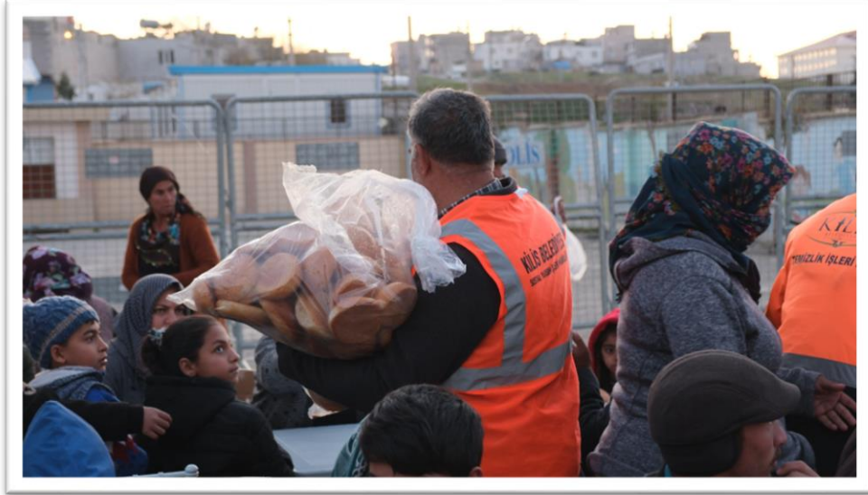
Iftar meal distributions

More than 500,000 meals have been served in the region so far. This week, IDRF, one of IBC's donor institutions, also visited our center in Kilis, and meetings were held for the coordination of the upcoming projects slated to begin in the coming days.