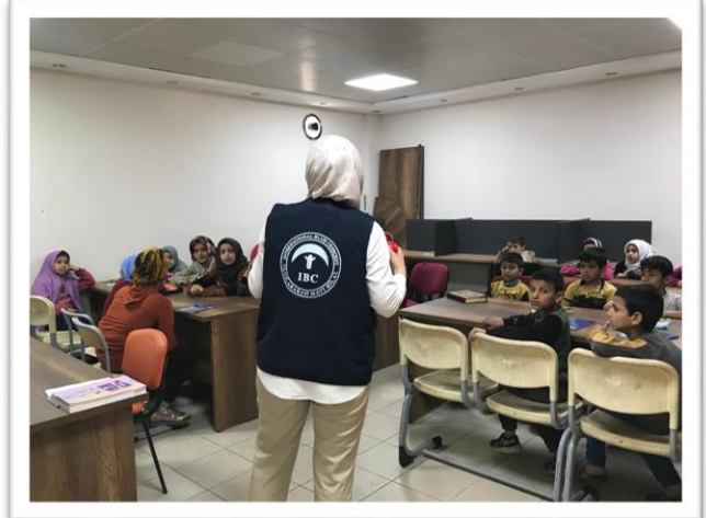
PSS event held at Hayati Harrani Youth Center in cooperation with Sanliurfa Metropolitan Municipality

Along with the IDRF representatives, the distribution of food packages to the flood-affected areas was also completed this week.