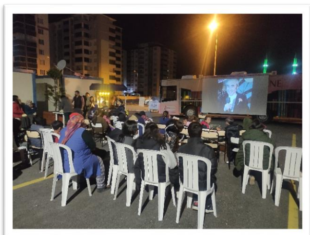
Film screening and popcorn prepared for children in Elbistan