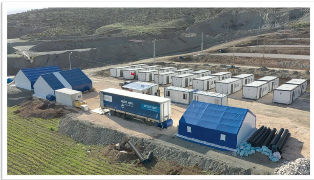
IBC Container City in Kirikhan, Hatay

Through the cluster system and coordination mechanisms, effective humanitarian aid is provided and standardized in line with international standards, preventing duplication of aid, and promoting humanitarian principles of neutrality, humanity, independence, and impartiality.