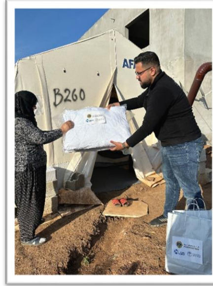
Distributions made in Islahiye with the support of Lions