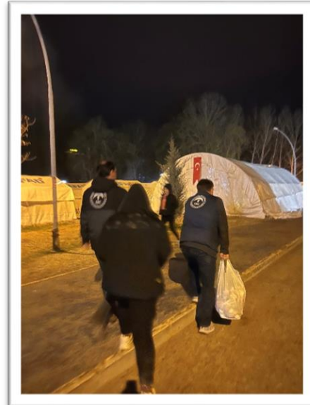
Distribution of suhoor meals to the tent area in Elbistan with the support of WHH