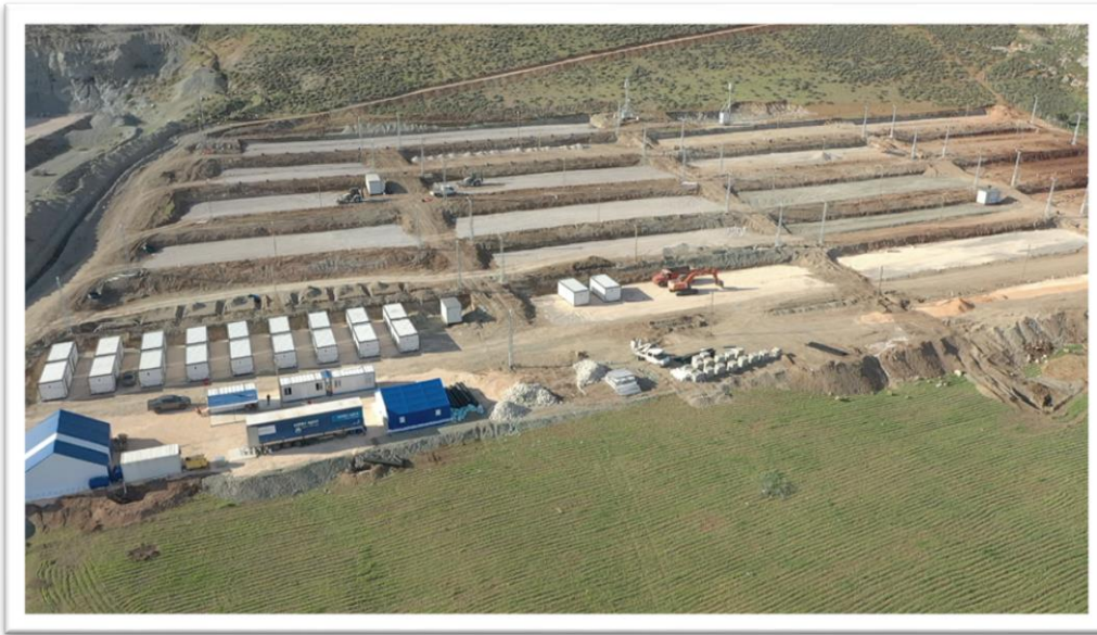
IBC Container City in Kirikhan

After the effects of the devastating earthquake and the losses it caused, the vital needs of the earthquake victims become more evident. Like many regions where life has come to a standstill, in Islahiye and Kirikhan, especially in villages, access to hot meals and self-care facilities is more than ever in places where tent settlements are set up. IBC, which performs needs analyzes at regular intervals in the earthquake area, has put the mobile kitchen, shower, and toilet, which it has completed, into the service of earthquake victims.