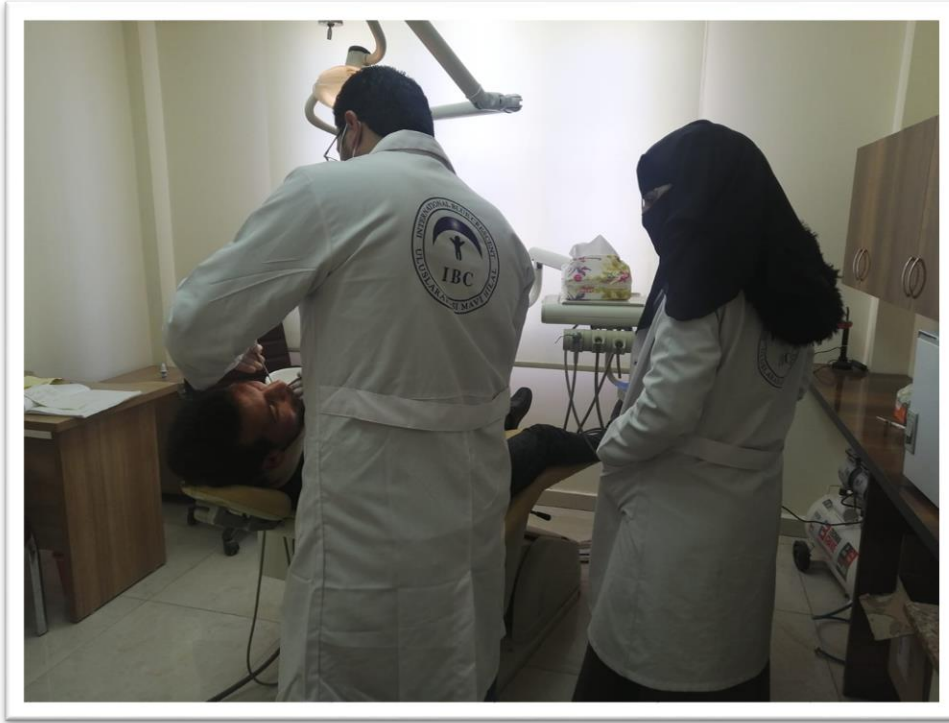
Dabiq Health Center

In addition, IBC's work continues at the Dabiq Health Center where services were provided for 833 patients this week. 15 patients were transferred to hospitals by IBC ambulances.