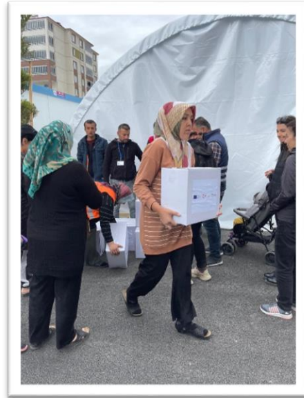
Hygiene kit distribution with the support of GIZ in the Kardes Sehirler Container City, Elbistan

The efforts have started to establish a mother-child center in the container city in the region with the support of the Japan International Support Program. Also this week, IBC has completed the distribution of hygiene kits to the Kardes Sehirler container city with the support of GIZ.