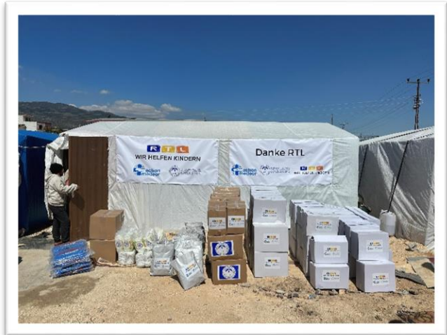
IBC hosted RTL on the field