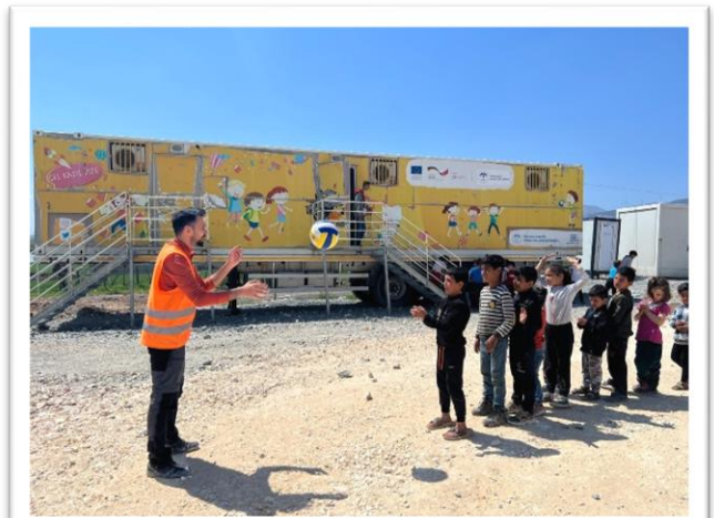
Workshops in the child caravan and tent camp in Nurdagi