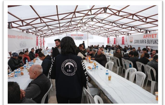
Iftar dinner given in cooperation with Sanliurfa Metropolitan Municipality