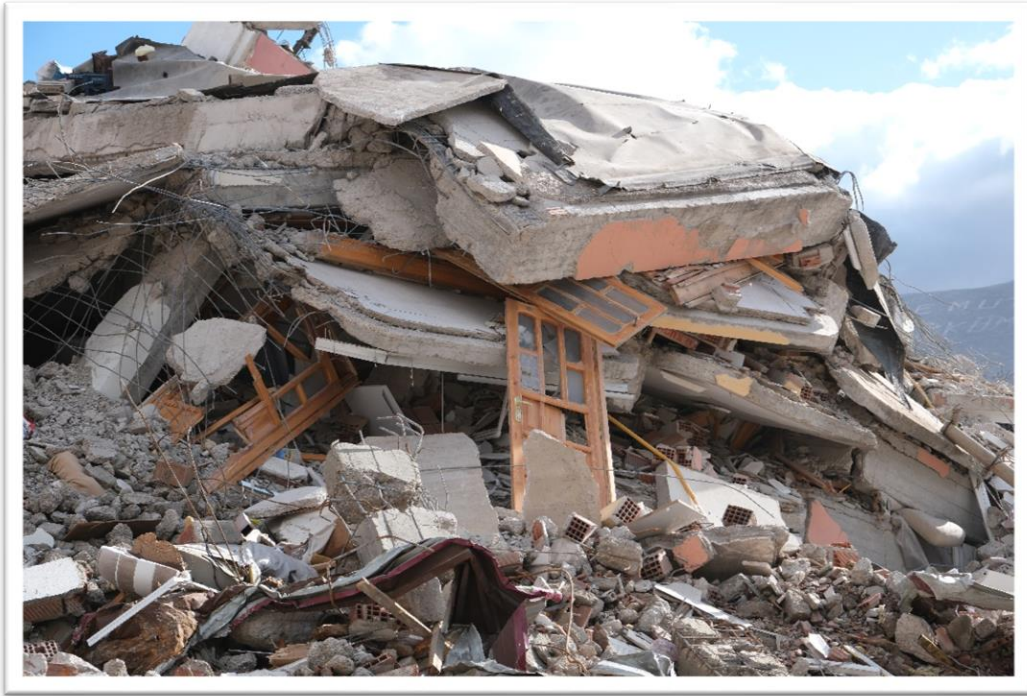
Elbistan / KAHRAMANMARAS

International Blue Crescent Relief and Development Foundation (IBC) would like to extend our sincere condolences to all those affected by the earthquakes. IBC employees in the region are safe and accounted for, though some have lost family members and loved ones and saw their entire homes destroyed. Thank you to all who continue to mobilize and to the heroic efforts of the many search and rescue teams. Immense and continued cooperation is needed to prevent further loss of life and suffering.