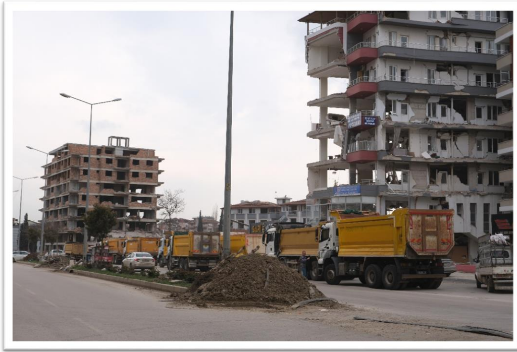
Demolition works being carried out in Antakya, Hatay.