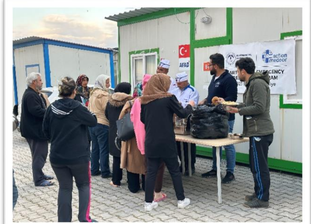
Iftar meal distribution in Islahiye with the support of Action Medeor

Also this week, food distribution for a total of 1000 people, 250 each to UKKASE Student Dormitory, Fevzipasa region, Memurkent Container area, and Islahiye Construction Site, was completed.