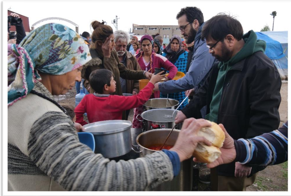
Distribution of iftar meal in the tent area in Kırıkkhan

With the month of Ramadan, IBC field team started to distribute iftar and sahur meals with the mobile food bank in the region.