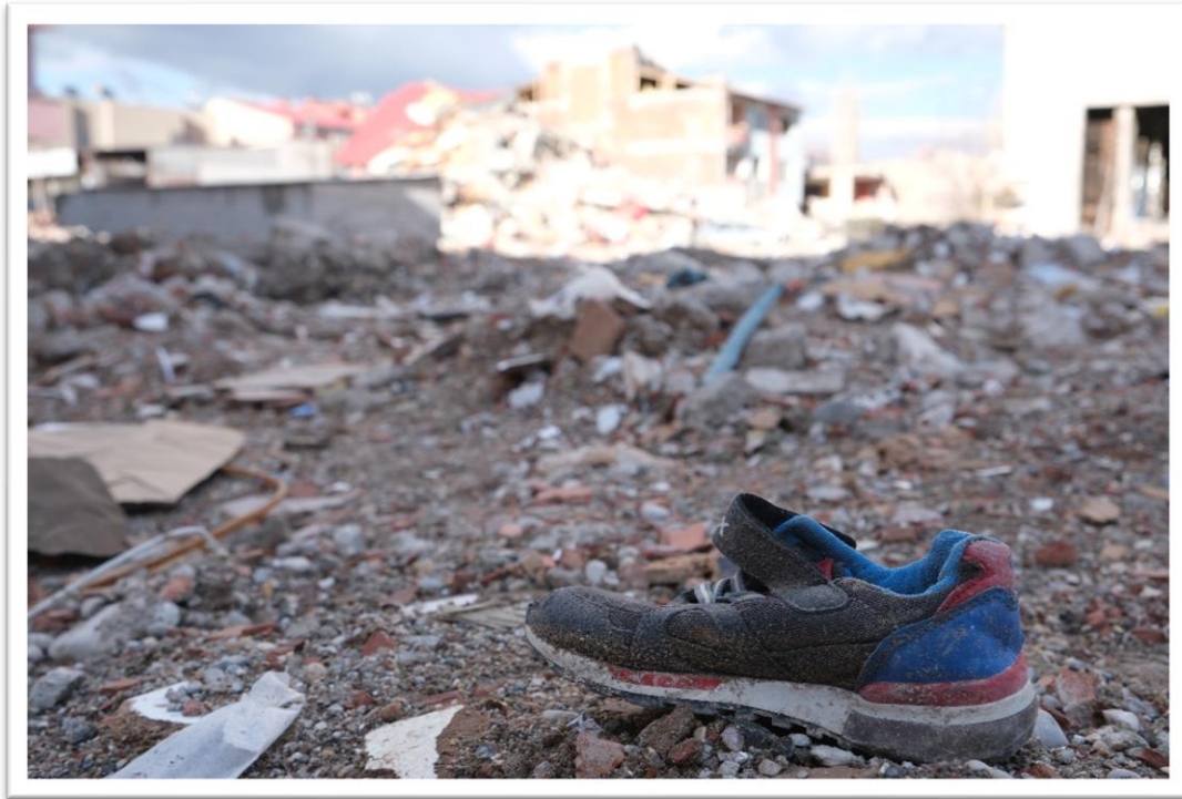
Elbistan / KAHRAMANMARAS

International Blue Crescent Relief and Development Foundation (IBC) would like to extend our sincere condolences to all those affected by the earthquakes. IBC employees in the region are safe and accounted for, though some have lost family members and loved ones and saw their entire homes destroyed. Thank you to all who continue to mobilize and to the heroic efforts of the many search and rescue teams. Immense and continued cooperation is needed to prevent further loss of life and suffering.