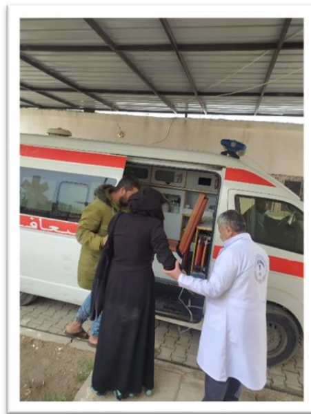
Health Center and Ambulance Services in Dabiq