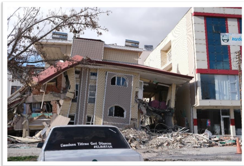
The remains of the building destroyed in the earthquake in Elbistan / Kahramanmaraş

Debris removal and demolition of heavily damaged buildings in the region continue in 14 neighborhoods. According to the latest data from Kahramanmaraş Municipality, the number of containers installed in the city has exceeded 8700. Tradesmen's bazaars are being rebuilt along with temporary accommodation centers in the region.