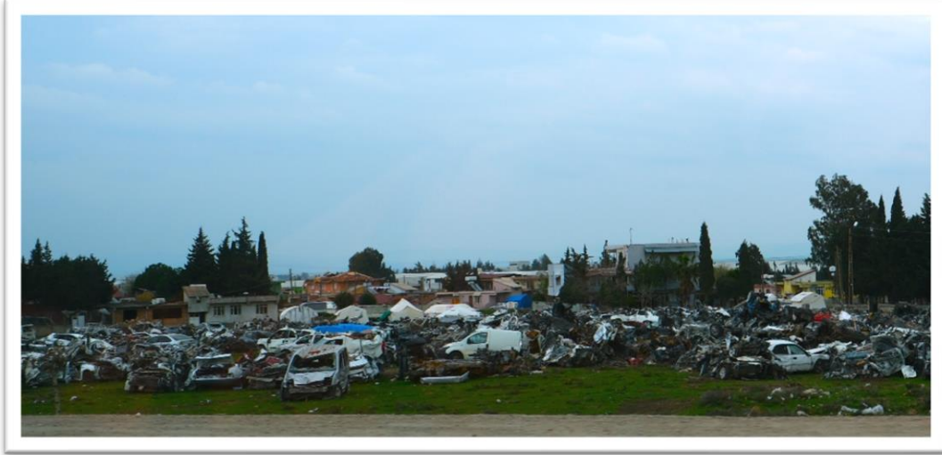
Demolition of damaged buildings in Hatay continues...

The construction of Antakya State Hospital with 400 beds, Iskenderun State Hospital with 600 beds, emergency hospital with 200 beds, and Defne State Hospital with 300 beds has also started in the region.