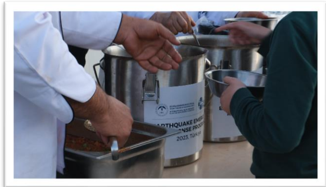
Iftar meal is given in a container in İslahiye with the support of Action Medeor