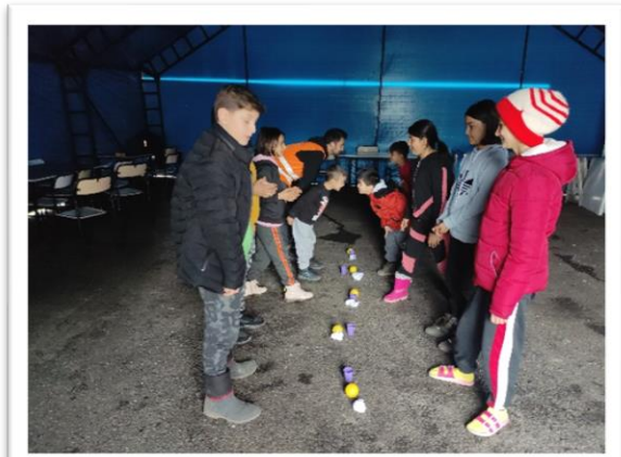
Workshops for children in a tent camp in Elbistan/ Kahramanmaraş