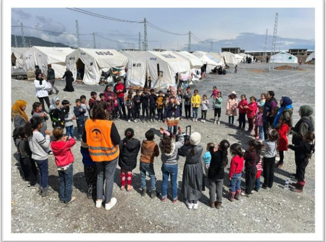
Workshops for children in the Child Caravan and tent camp (Nurdagi/Gaziantep)