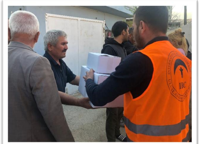
Food and hygiene package support