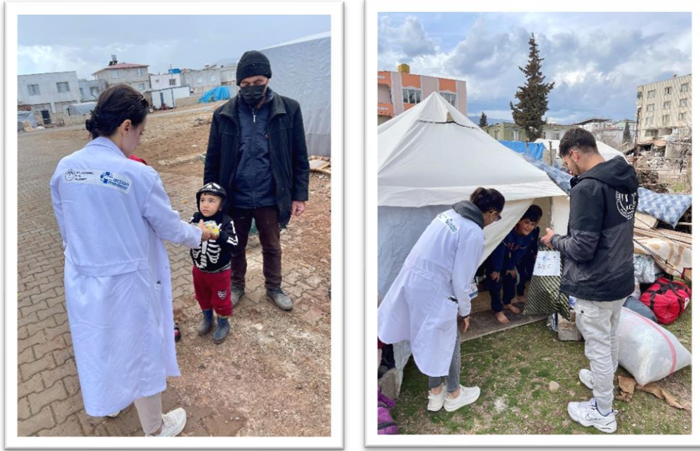
Distributions for children with the support of Action Medeor

Children are among the most vulnerable groups affected by the earthquake. IBC also provides clothing, health aids (including medicine and mobile services), hygiene materials, diapers, and food support for newborns, under-three and school-age children, which it prioritizes in humanitarian aid. The aim here is to reach children of all ages and meet their needs while preventing risks such as possible secondary tertiary health, hygiene, and intellectual disability.