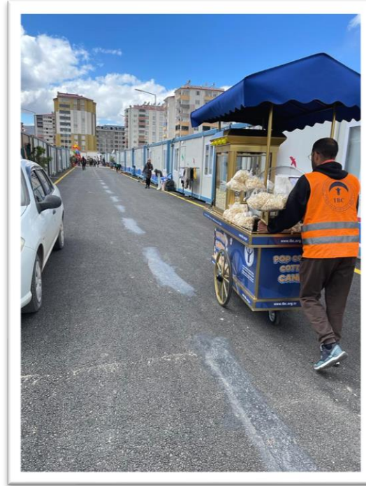
Popcorn Machine for Kahramanmaraş / Elbistan Child-Friendly Area

While social cohesion activities were carried out for children at Ekinözü Primary School in the region, a popcorn machine was installed for children in the child-friendly tent in Elbistan and movie screenings began.