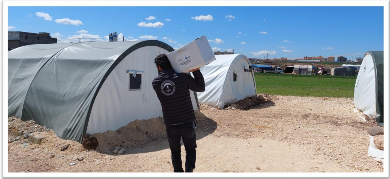
Hygiene kits were distributed in 3 camps in N. Syria with the support of Action Medeor.