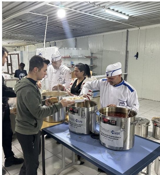
Hot Meals Distribution

More than 2000 hot meals are served daily in the mobile kitchens developed by IBC in the region. With the onset of Ramadan, hot meals are regularly distributed to earthquake victims, especially those who don't have access to hot meals during the fast-breaking hours, in the container cities in İslahiye, the credit dormitories institution, the Fevzipaşa region, the camp construction, and the tent cities in the center of Kırıkhan. Hot meal aid is not limited to the month of Ramadan but will continue as two meals a day during and after the feast.