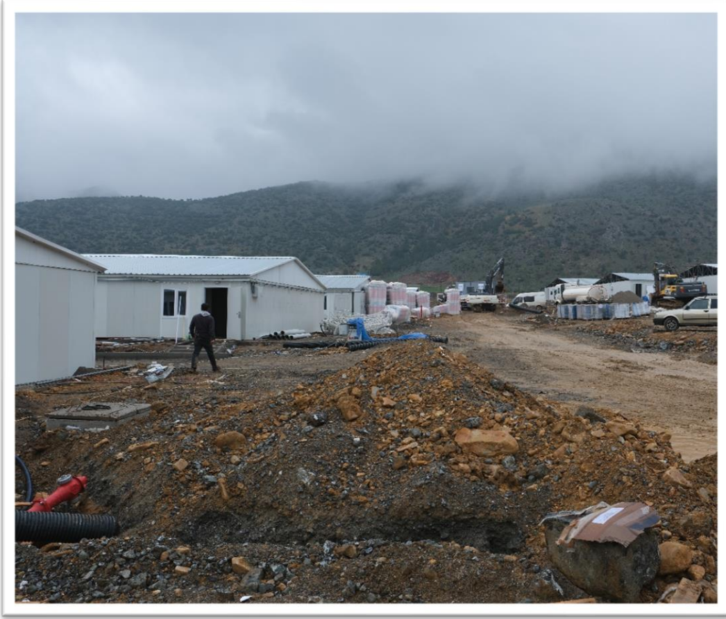
Container City Construction in Islahiye/Gaziantep