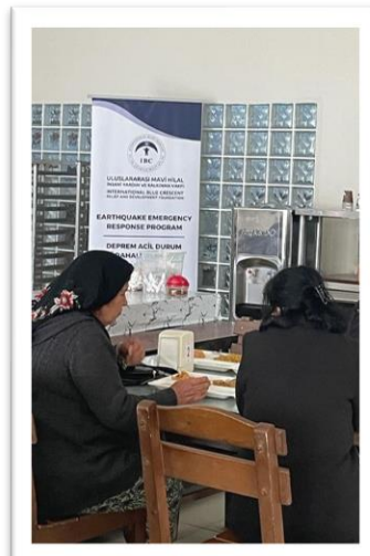
Air Force Special Education Center in Ozdere/Izmir