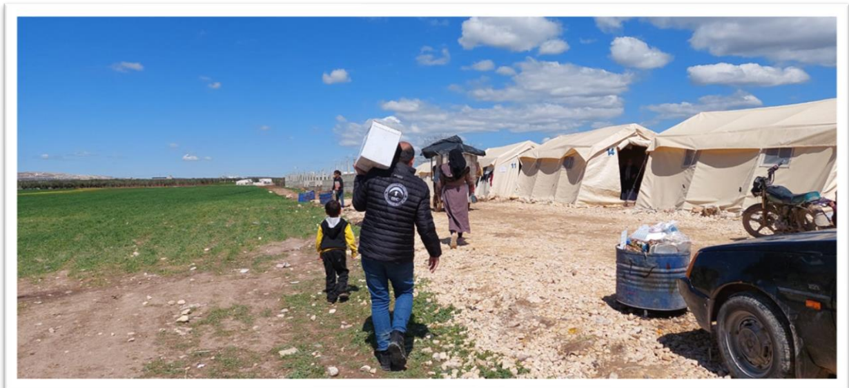
Tent Camp in N. Syria – Aid delivered to earthquake victims in need by IBC staff

42.4 percent of the country's population lives in Aleppo, Hama, Idlib, Latakia, and Tartus, which are the five worst-hit provinces of Syria. Of the 7.1 million people of working age (age 16 or over) in this population, 2.7 million were employed, either formally or informally, and 22.8 percent of them were women. Workers and businesses need urgent help to rebuild livelihoods and prevent poverty, informality and exploitation in the region.