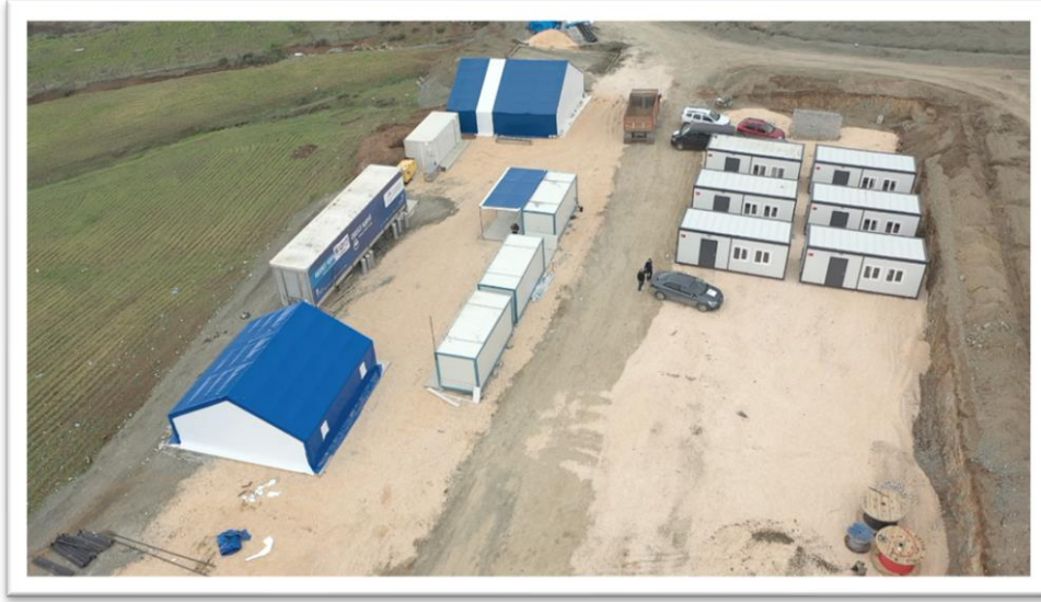
The Kirikhan Container Camp