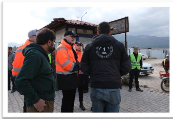
Stove distribution in cooperation with Istanbul Aydın University and AKEV / Malatya

More than 500,000 meals have been served in the region so far. This IBC partner IDRF Canada also visited our center in Kilis, and meetings were held for the coordination of the upcoming projects slated to begin in the coming days.