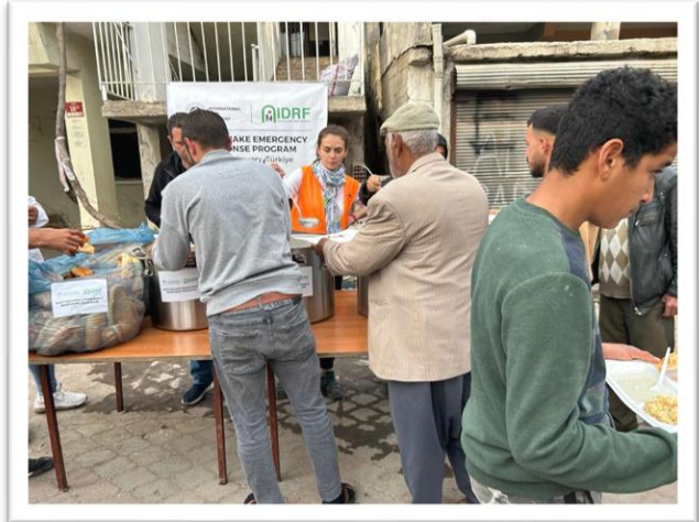
Iftar meal distribution with the support of IDRF