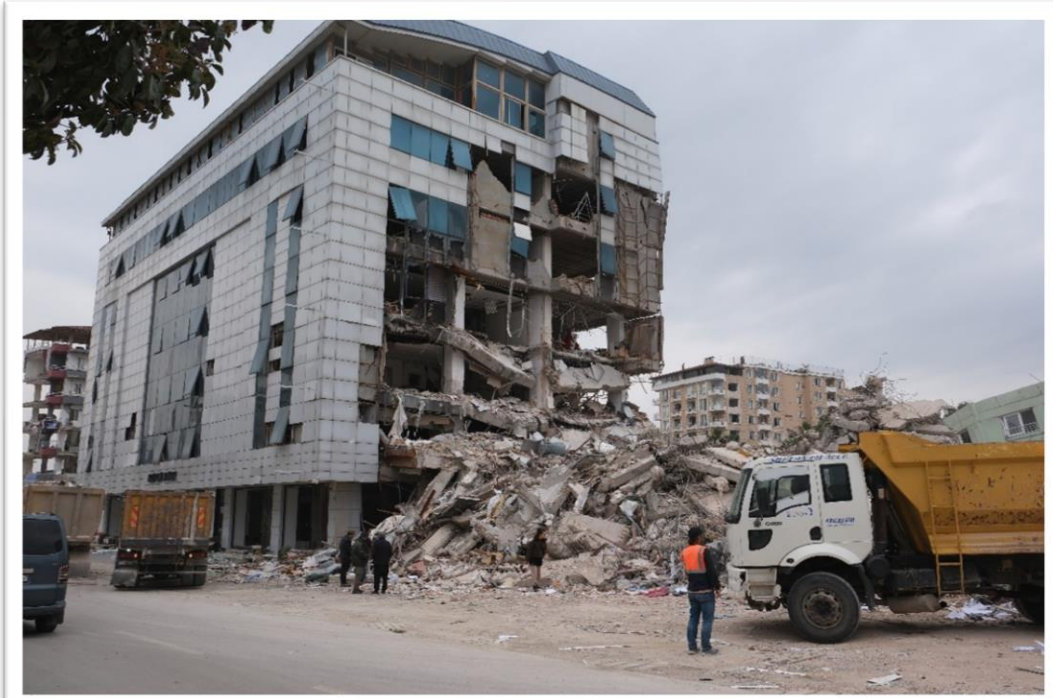
A building to be demolished in Kirikhan /Hatay

UNDP has called for approximately $550 million in funding for sustainable improvement. UNDP initiatives to be considered by international donors include preserving local identity and the cultural heritage that underpins tourism recovery, safe removal of debris, and recycling and reuse when construction begins.