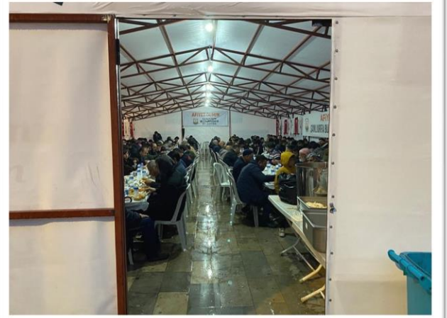
Iftar meal given in cooperation with Şanlıurfa Metropolitan Municipality